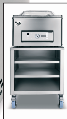
Optional stainless steel mobile stand available.